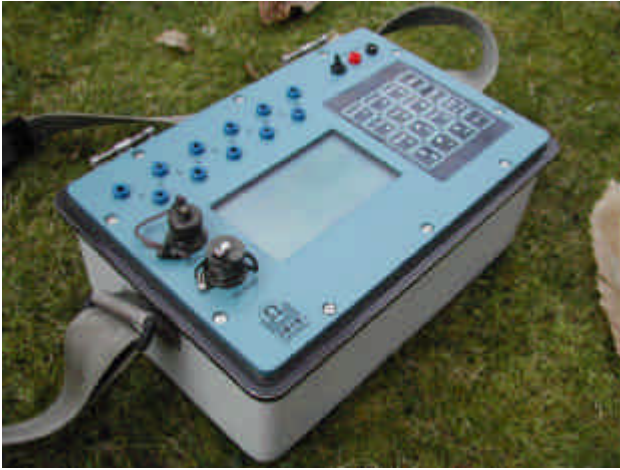
ELREC Pro unit with its graphic LCD screen