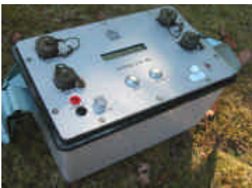
Extension Switch Pro box able to drive 24 - 48 - 72 or 96 electrodes

Extension Switch Pro box(es), with specific cables, can be connected to the ELREC Pro unit for an automatic switching of the reception electrodes according to preset sequence of measurements ; these sequences have to be created and uploaded to the unit from the ELECTRE II software.